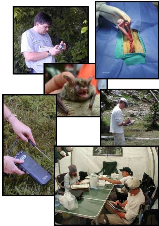
Collecting Digital Images and Data