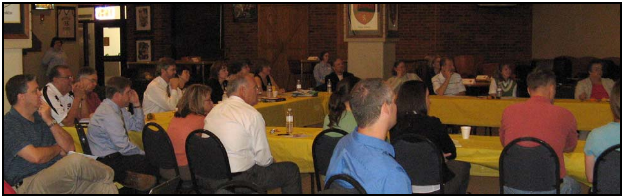
Eighty-two Faculty, Staff, and Administrators attended the 10th Annual Teaching and Technology Forum.