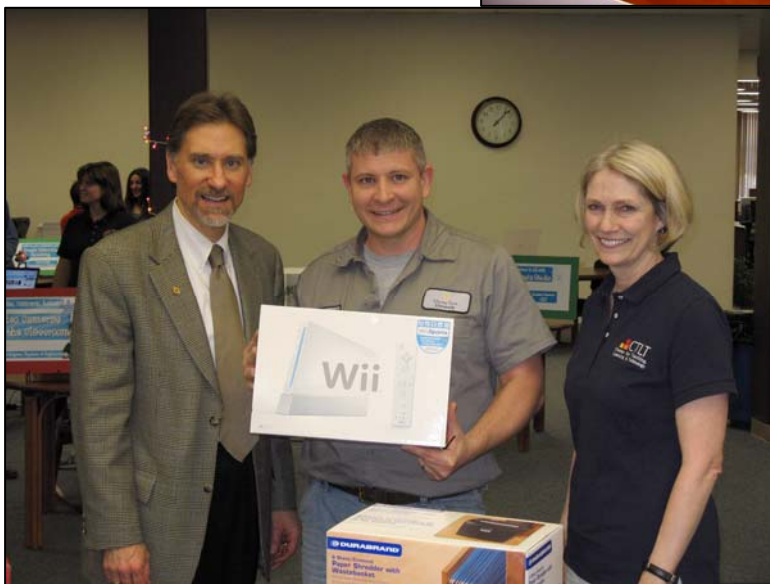
Grand prize for 12 Gadgets was a Nintendo Wii.