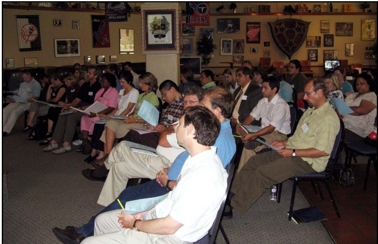
CTLT hosted 33 participants at the 2007 New Faculty Orientation.