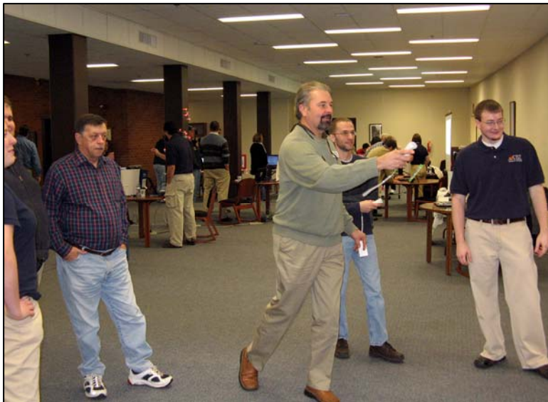
Participants “bowled” with the Nintendo Wii interactive gaming system.