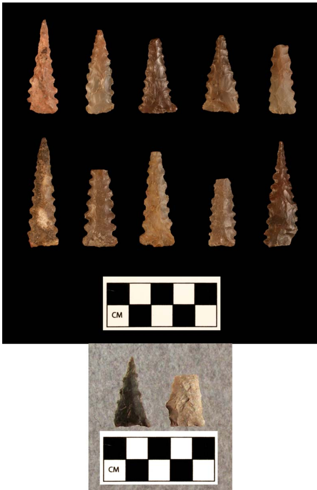
Figure 1. Type 3 Fine Triangular: Coarsely Serrated: Top and middle rows, Fox Farm; Bottom row, Elk Fork (from Bradbury et al. 2011).