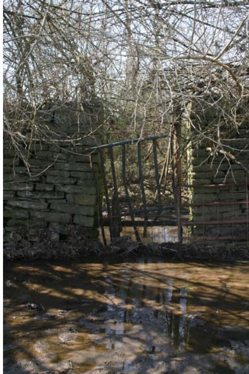
Figure 5. Dry stone water gap near the cow barn.