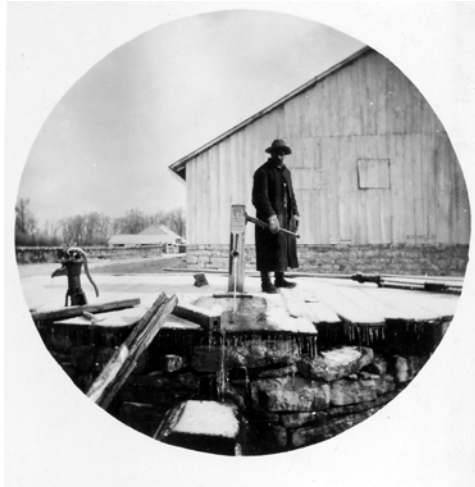
Figure 3. Cistern/well at west end of the barn.

water gaps (Figure 5). At least one stone capped culvert carried a path across the stream. When it flowed, the branch watered the enclosed cattle lots. In short, the investment in the total complex was integrated and substantial.