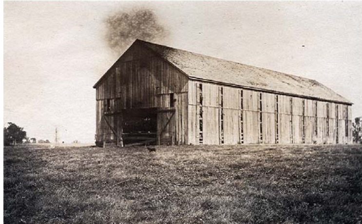
Figure 8. Tobacco barn built on Clay's farm circa 1908

Other regions were experimenting with so-called transverse barns in the 19th Century, notably New England. What became known as the "New England" barn (cf. Garrison 1991:132) with its gable entrances and a center aisle, broke free from the constricted, cubical space of the "English barn" or "three-bay threshing barn" (Calkins and Perkins 1995) with its side entrances producing a frame which could be expanded in length in a way the English barn could not (except by appending to it another English barn) through the multiplication of transverse "bays" (which in Kentucky, in the context of the tobacco barn, would become known as "bents" of shed-aisle-shed). It was also, by the nature of things, wider than the English barn: it had to be because of the space requirements of the central aisle (Garrison 1991:132). At the New England Farmer commented in 1858, "...A barn should be at least thirty-six feet wide, with twenty feet posts. Forty-two feet wide is a better dimension. The length may be eighty feet, one hundred feet, or longer if needed. Even two hundred feet is better than three separate barns (emphasis added)." (quoted in Visser: 1997:74). The logical evolutionary result of this in the Connecticut River Valley of which Garrison writes (1991, see also Raitz 1995), was an air-cured tobacco shed not unlike the large,