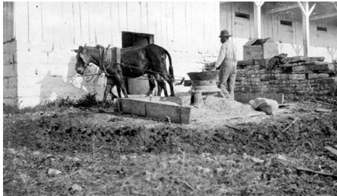
Figure 2. Corn/cob grinder in operation at west end of the barn, circa 1908

cast iron corn and cob grinder powered by two mules ( The Western Farm Journal 1856, Oct.17:1:16) in operation in front of a side door to this portion of the barn (Figure 2). Because of the feed cart in the center aisle which accessed this room, it is probable that this end of the structure was reserved for the preparation, perhaps storage, of prepared grain rations for stabled cattle.