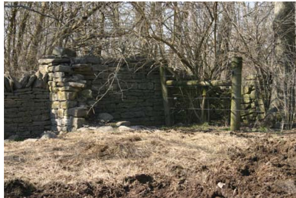
Figure 4. Remains of the feed cooking structure.

With its emphasis on the specialized preparation of cooked feed and ease of feeding it, Clay's large cow house appears to have been principally a structure for feeding cattle. In design it has certain antecedents, although there probably were important differences in floor plan and detailing which