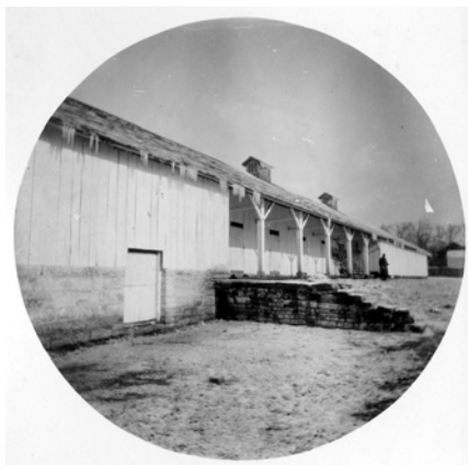
Figure 1. Exterior photograph of south side showing stalls (photo by M.H.Clay, circa 1895).

On its western end the barn foundations butted against a 25 x 46 foot dry stone foundation which originally stood to a height of about four feet and defined a floor 4 feet below the level of the aisle and stalls to the east. This room, the width of the barn and sheds, was at right angle to the longer structure. One photograph from about 1908 shows a “Little Giant” (or similar) brand