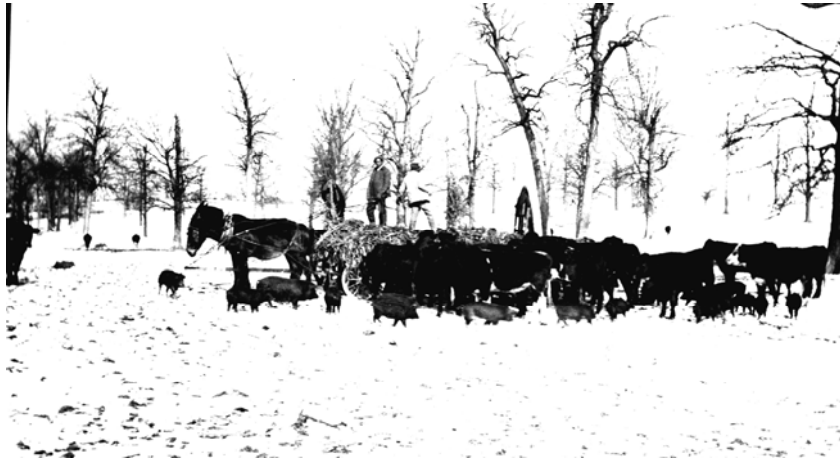
Figure 10. An old pattern returned: winter feeding of corn fodder to comingled cattle and hogs circa 1908

of these, the center of slaughtering shifted west from Cincinnati to Chicago. By the end of the 1860s the Chicago stockyard dominated meat production in a country (Cronon 1991-218-224) which emphasized feeding cattle to younger ages and lighter weights in response to market demands. In Kentucky, cattle feeding shifted to (more correctly reverted to) earlier patterns which stressed open air feeding of corn and forage. So it was on Clay's farm (Figure 10). Surviving documents, furthermore, record the sales of large lots of fed cattle to order buyers who would then ship them by rail to one or more consuming centers, a pattern which exists today. In this changed system there was little place for specialized, intensive stall feeding.