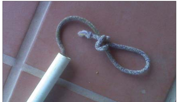
Figure 3. Snake catcher. Home-made snake catchers consist of a piece of rope creating a loop and threaded through PVC pipe. The loop is lassoed around the snake and then pulled tight to the PVC pipe.

2.3 Your group now sits down together to discuss your study and to formulate a testable hypothesis. As you know, HWE defines a system that is not evolving. How is that useful to the situation you are looking at? That is, what