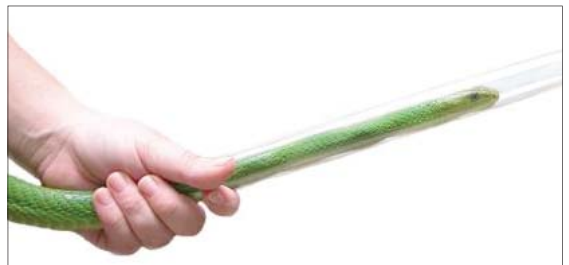
Figure 4. Snake pipe. A long tube that snakes are encouraged into; it is too narrow for a snake to turn around in, allowing for sampling.