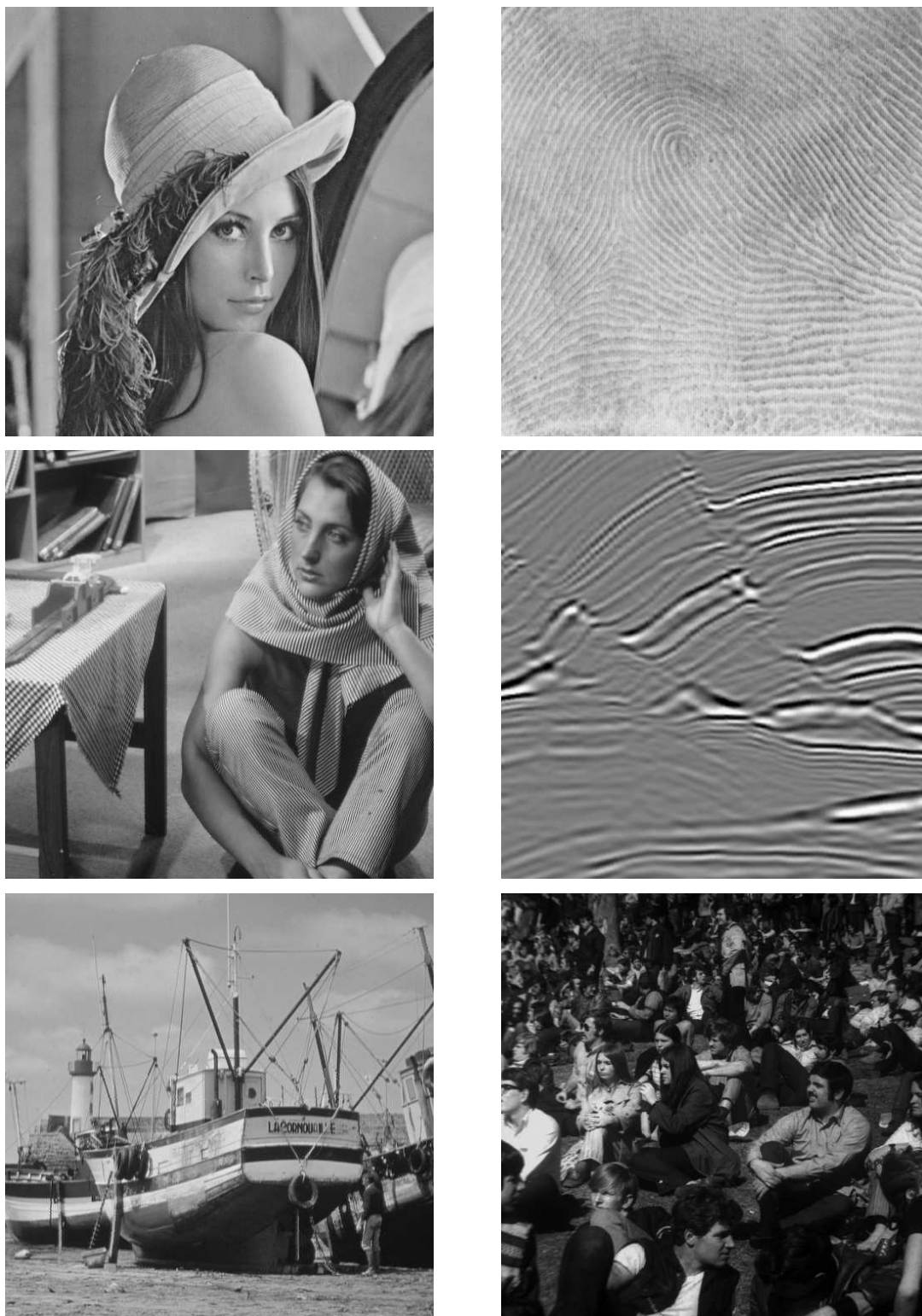
Fig. 3. Test images: Lenna, Finger-print, Barbara, Marmousi, Boat, and Crowd.